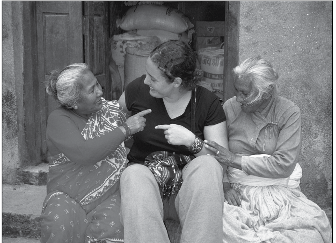
Ann Arbor-based eco-friendly travel company, Journeys International, has been taking adventurous souls to exotic locales for 30 years. (Read about them on page 9.)